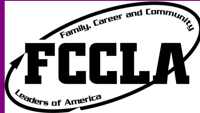
Teaching as a Profession